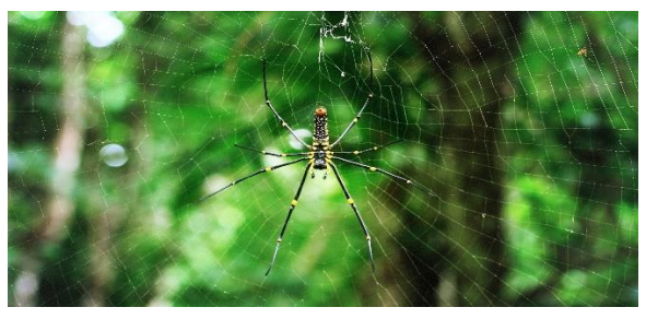
Creating natural products and services in trade with i-NAF

Natural accreditations granted by i-NAF MLA signatories are recognised it will be global purposed it will be on their equivalent natural accreditation programs.